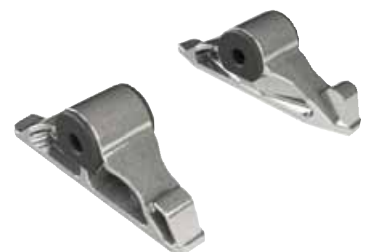
RK-X700 RH & LH Brackets