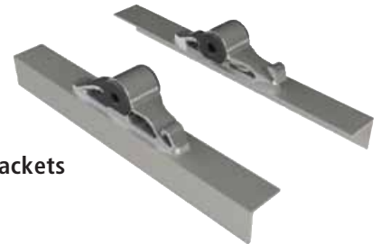
RK-W600-G RH & LH Brackets