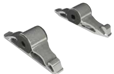
RK-X600 RH & LH Brackets