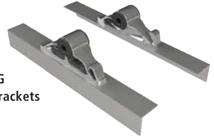
RK-W700-G RH & LH Brackets