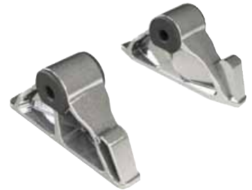
RK-X900 RH & LH Brackets